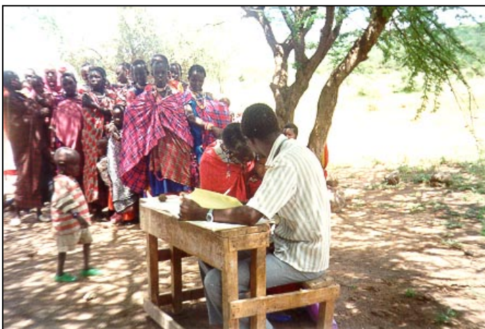
Mobile, rural open-air clinic in Kajiado

Source: Regional Government Statistics, AIDS in Kenya 2001 Note: HIV prevalence is of pop aged 10+. % in paid employment is % of economically active population